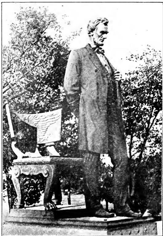
ST. GAUDENS' STATUE OF LINCOLN, IN LINCOLN PARK, CHICAGO.